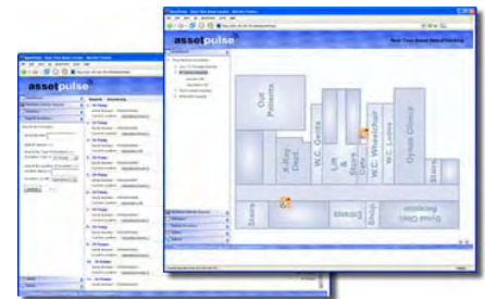
AssetGather's Web-Based Alerts and Reports