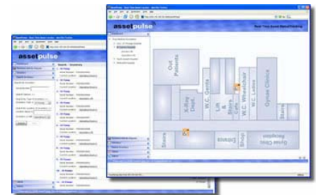
AssetGather's Web-Based Alerts and Reports